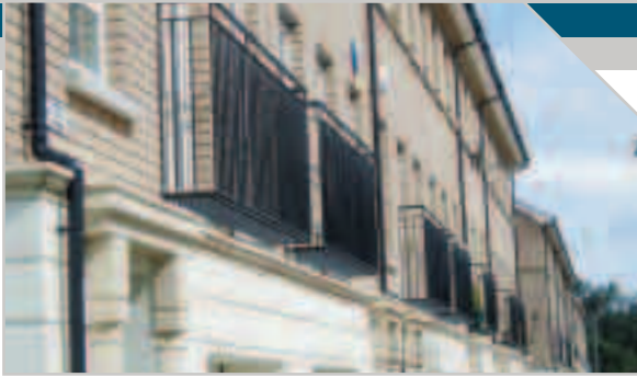
Balconies at Leatham Square