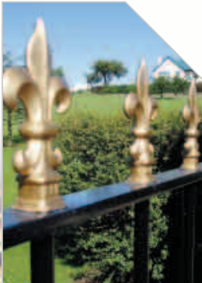
Fleur de L'Eiseè Rail Heads

creative solutions : designed & delivered