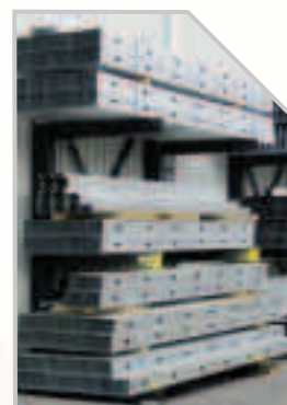
Installation at Charles Tennants