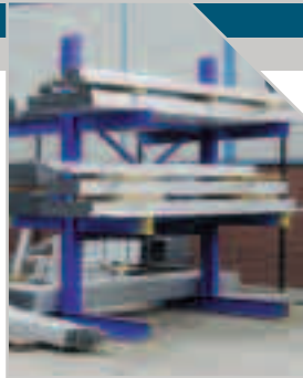
Heavy Duty Storage Racking